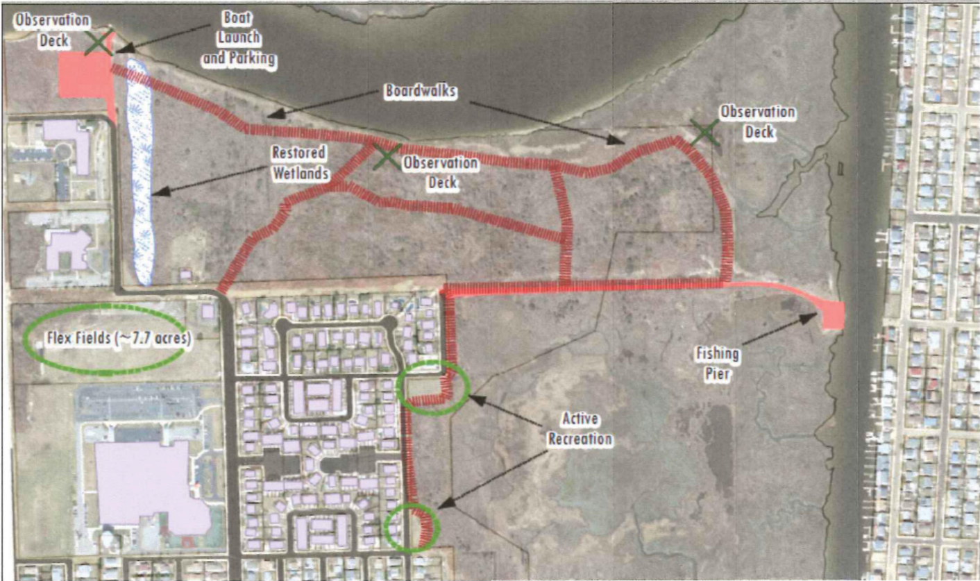
Figure 5.10 - Ventnor West EcoPark Concept Plan